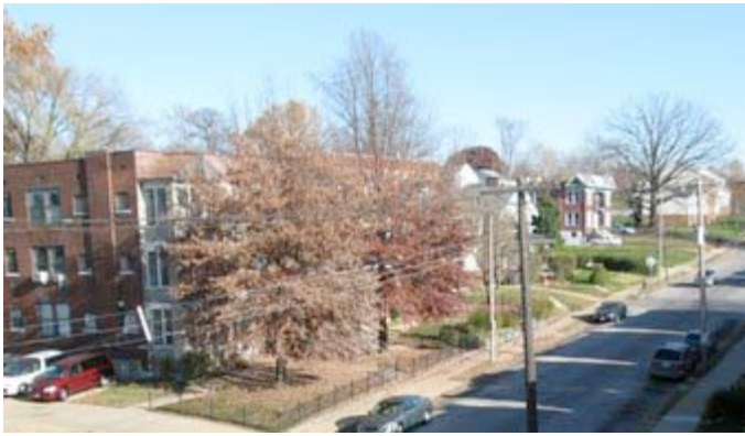
6000 block of Etzel Ave. looking east

(Prayer request, continued from previous page) rely on gifts and grants for new projects.