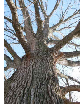
I am the vine...

Understandably, a project of this scale inevitably faces the daunting task of negotiating the concerns of property owners and project planners. We at Cornerstone are excited about the prospect of seeing Etzel transformed into a trail and tree-lined street that invites the community to get outside and walk to wellness. See you on the trail.